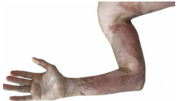
F. Condition after 2,5 months after treatment