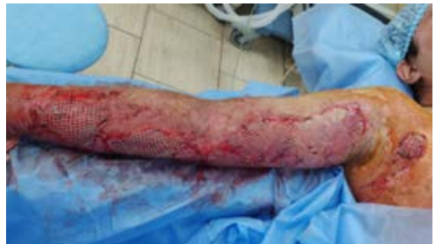
D. 32 day since admission, right upper limb. Condition after autodermoplasty with a free split-thickness skin flap using allogeneic human dermal fibroblast (13.11.25)