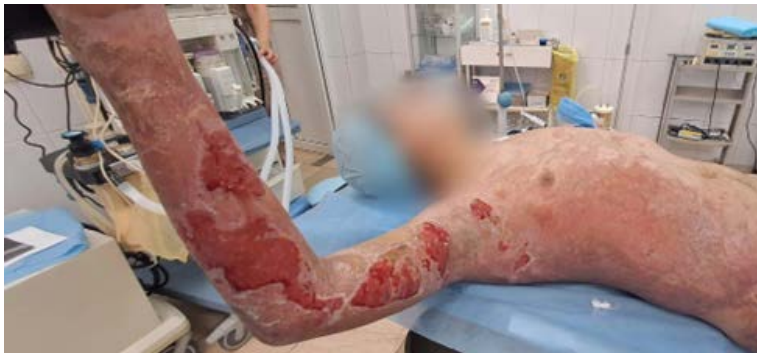
C. 32 day from the moment of admission of the right upper limb: preparatory stage before autodermoplasty with a free split skin flap (13.11.25)