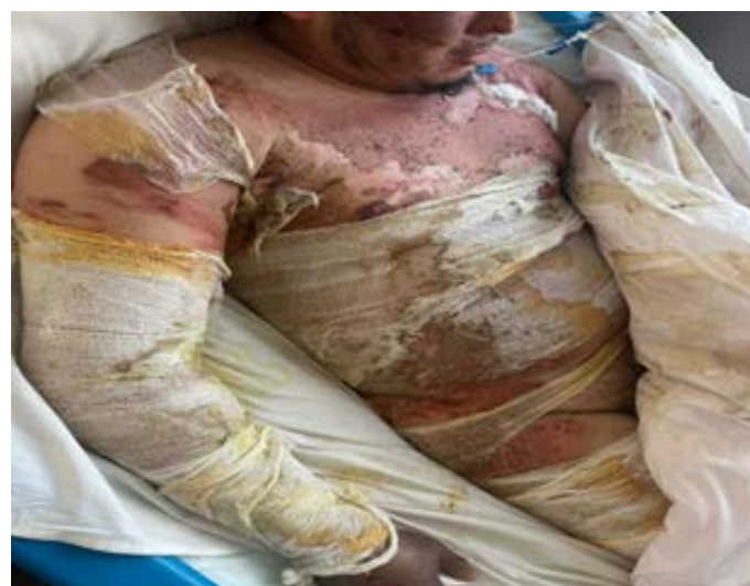
Figure 1. The first 24 hours after admission.

St. Localis: Upon examination, burn wounds are present on the face, neck, right upper limb, back, and extending to the lateral