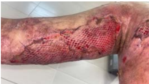
E. 36 day from the moment of admission of the right shoulder. 4th day after autodermoplasty with a free split-thickness skin flap using allogeneic human skin fibroblast