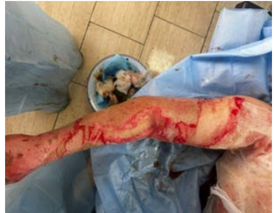
B. Eighth day after admission (20.10.25). The right upper limb has burn surfaces of a circular nature, in the form of extensive areas of pale pink de-epithelialization, with areas of chiseled necrosis in the form of "dew drops". Foci of coagulation necrosis are noted