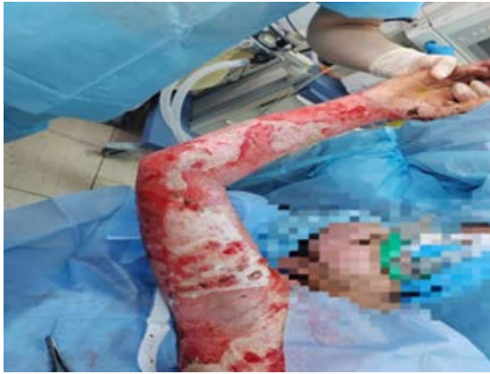
A. Third day from the moment of admission: right upper limb (15.10.25). There are circular affected surfaces with isolated areas of necrosis, focal areas with deep de-epithelialized whitish-colored surfaces.